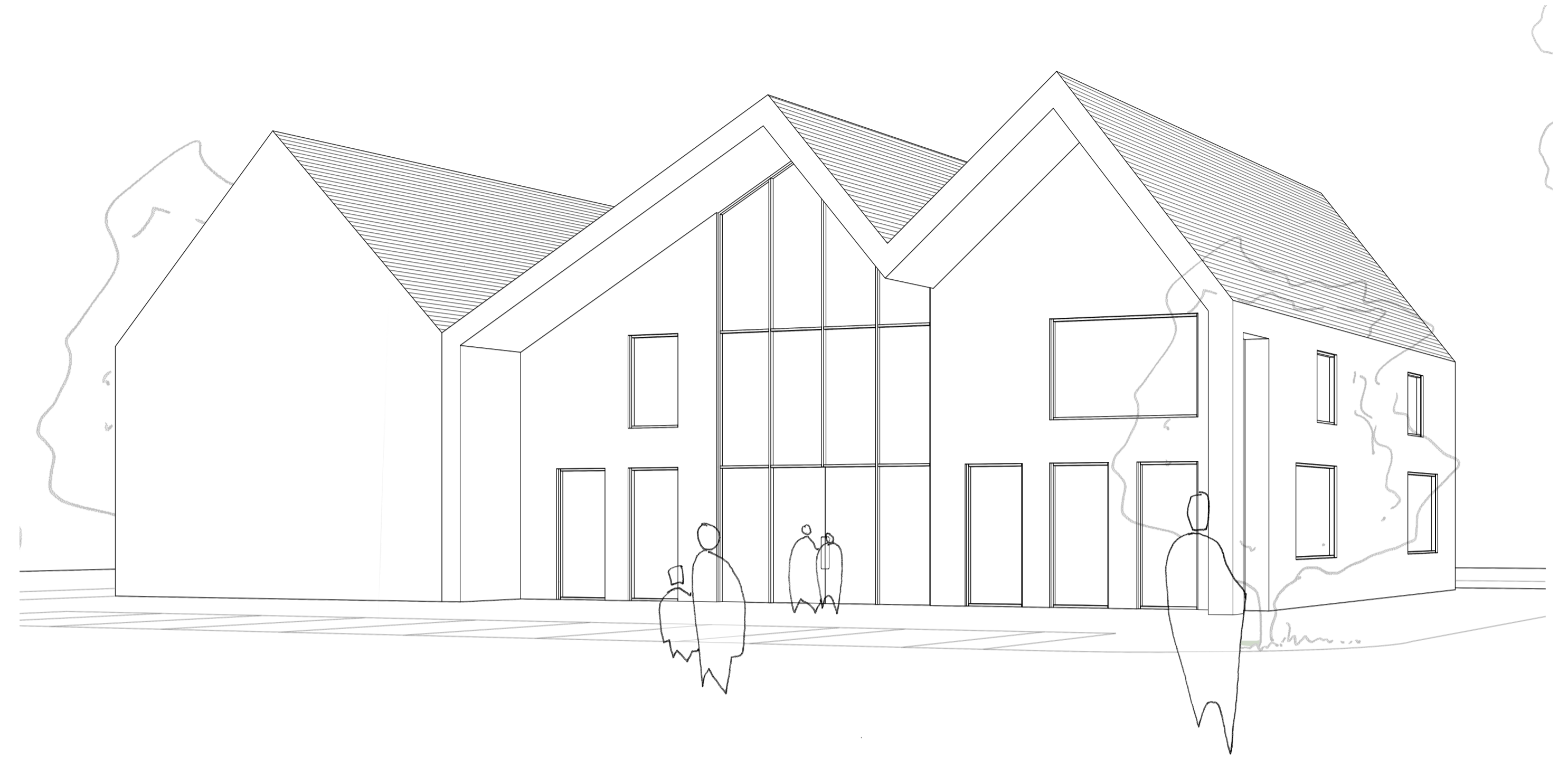
Indicative 3D View