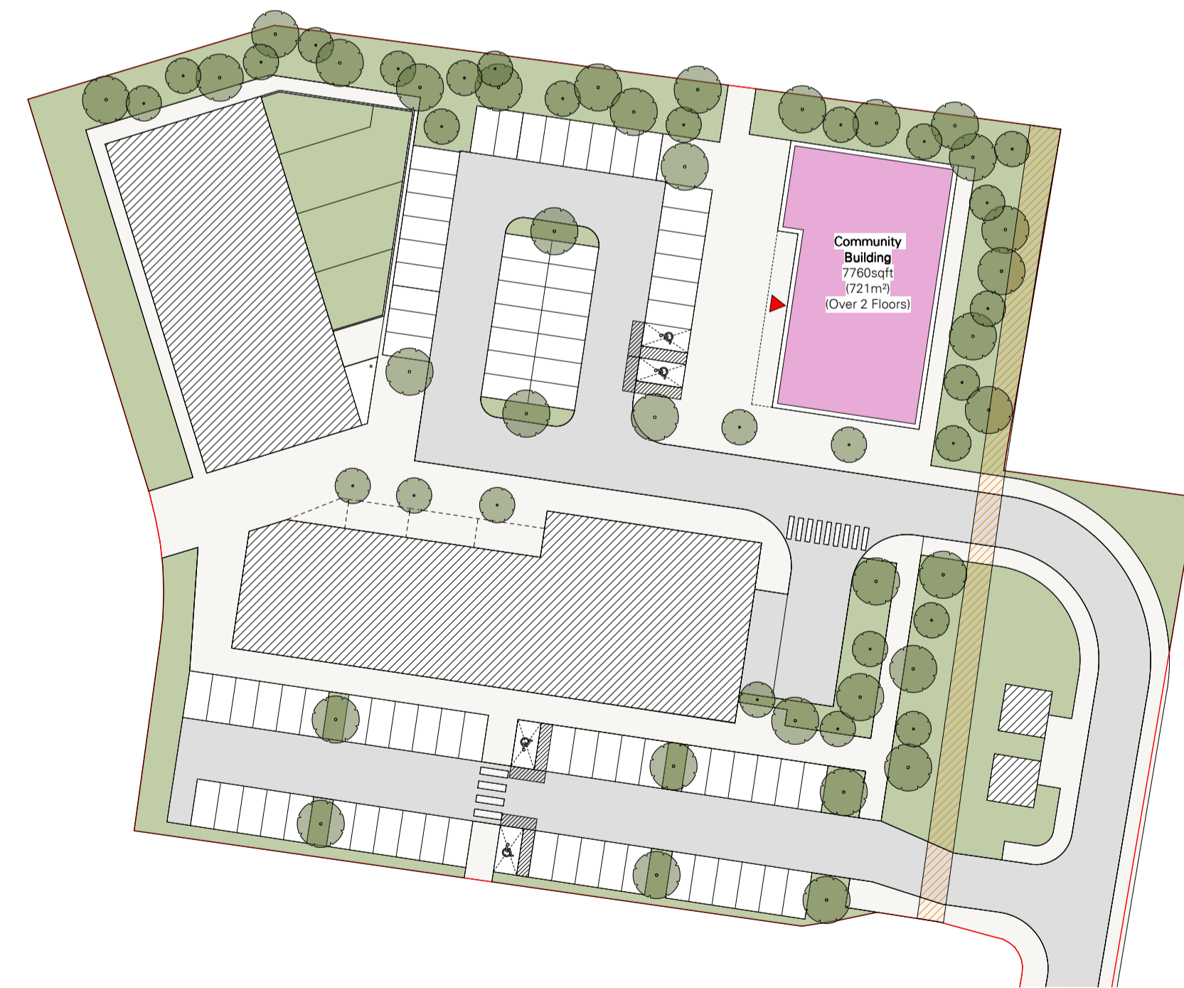
Local Centre Location